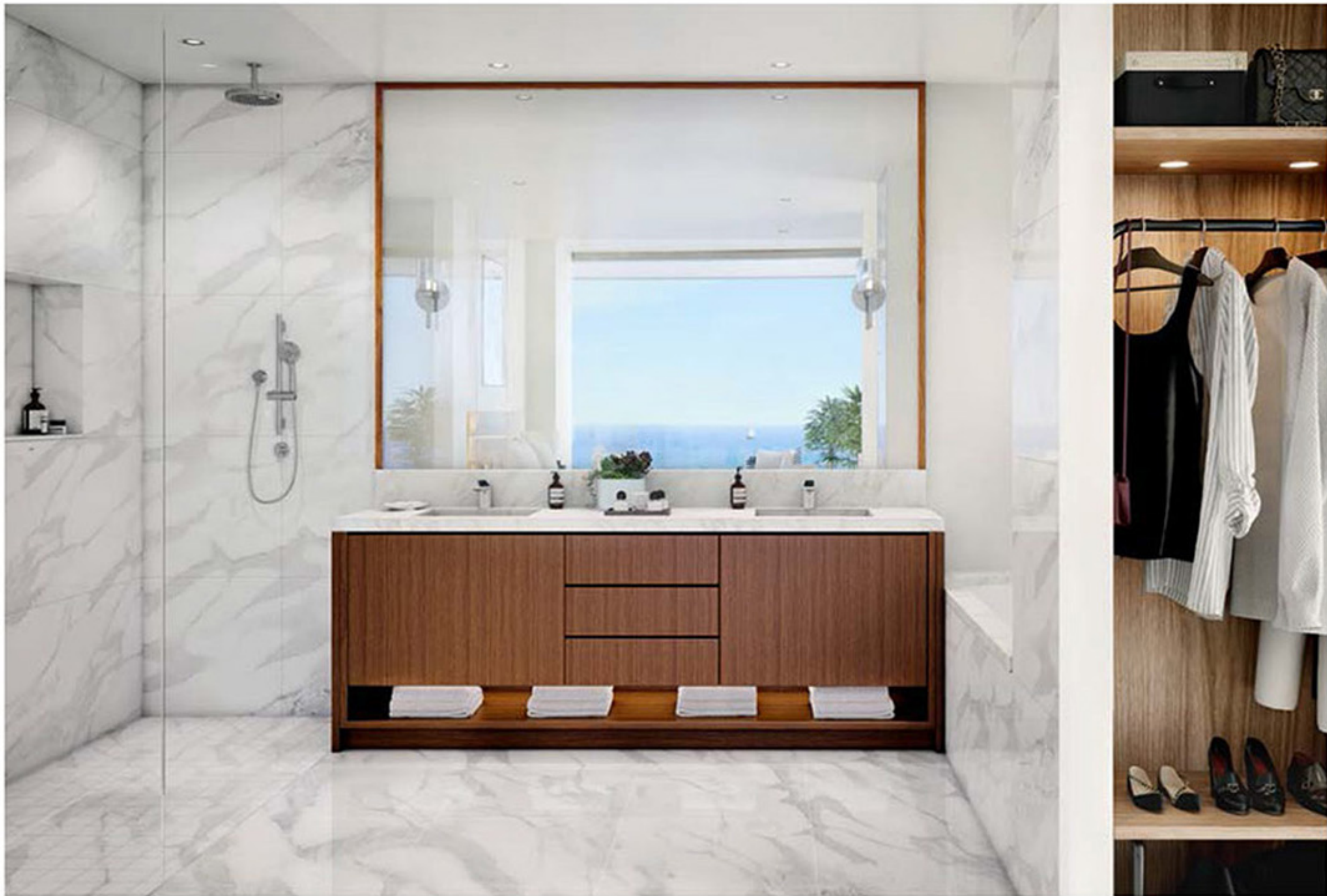
Sleek and spa-like, the master bathrooms feature a material mix of natural stone selections, stained wood and porcelain tile, creating an atmosphere of peace and relaxation.