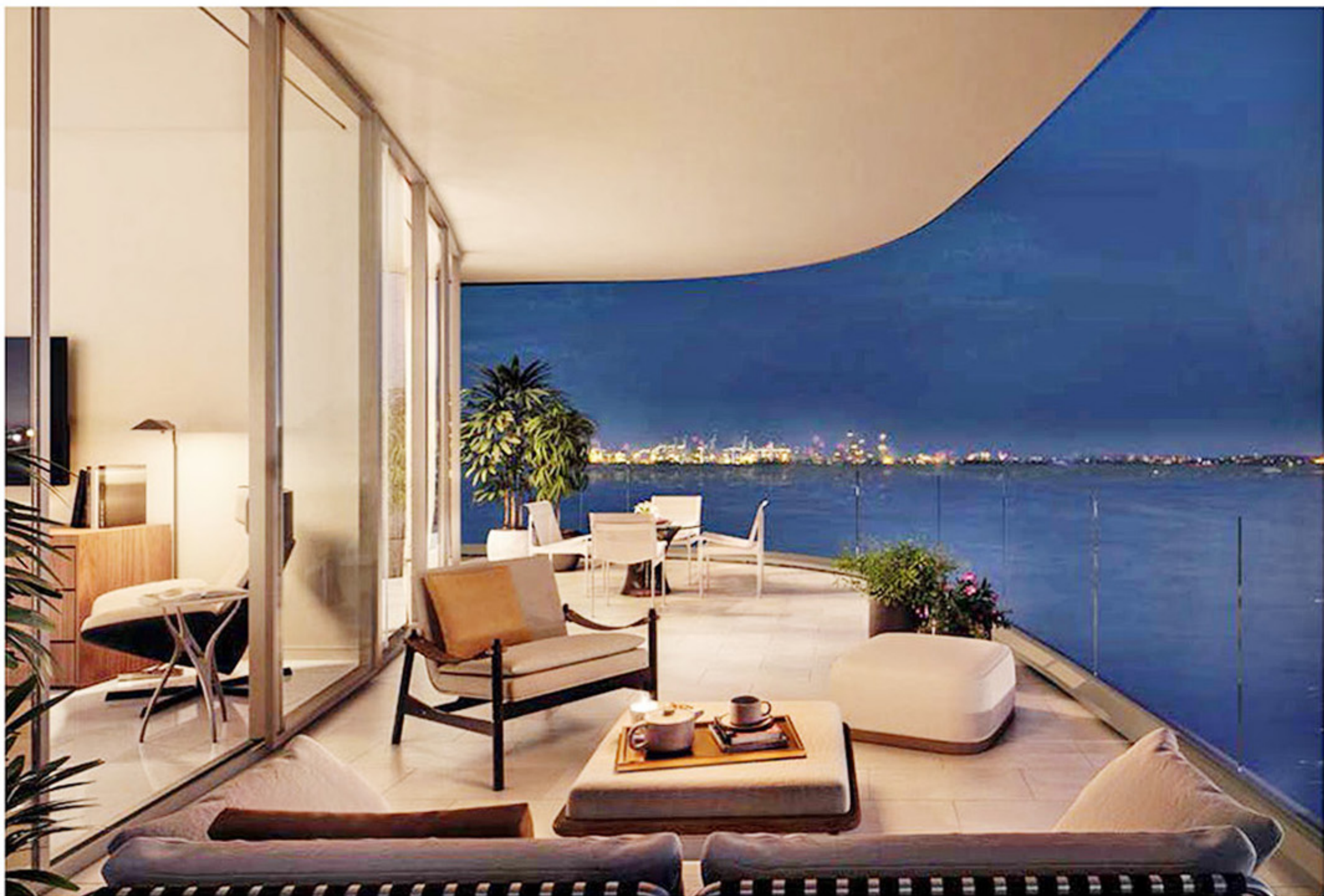
The sublime views of Biscayne Bay and beyond can be enjoyed to the fullest on the 10-foot-deep terraces.