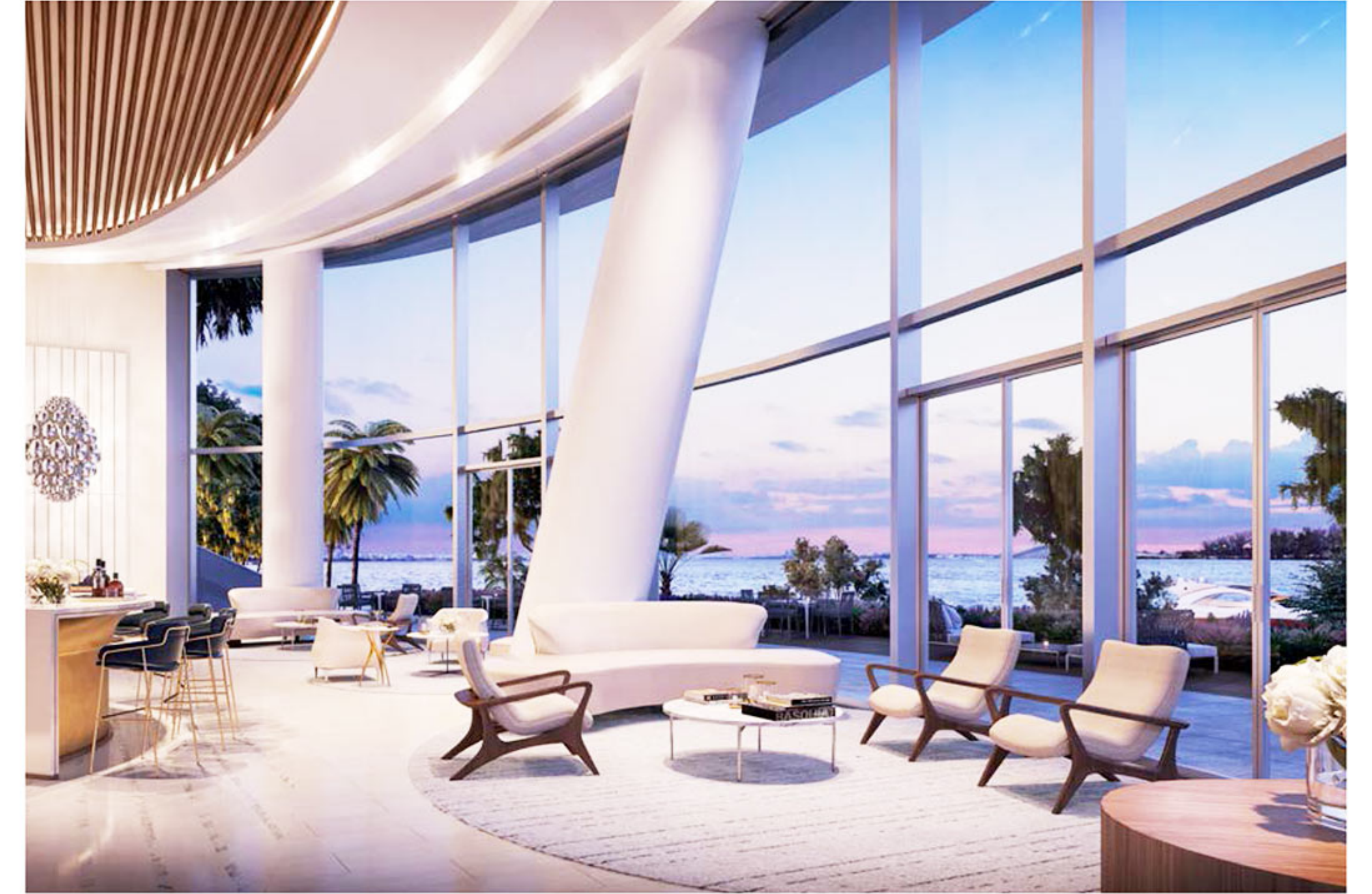
The private owners' lounge, adjacent to the lobby, features a double height bank of windows with sweeping views of the water and the private gardens.