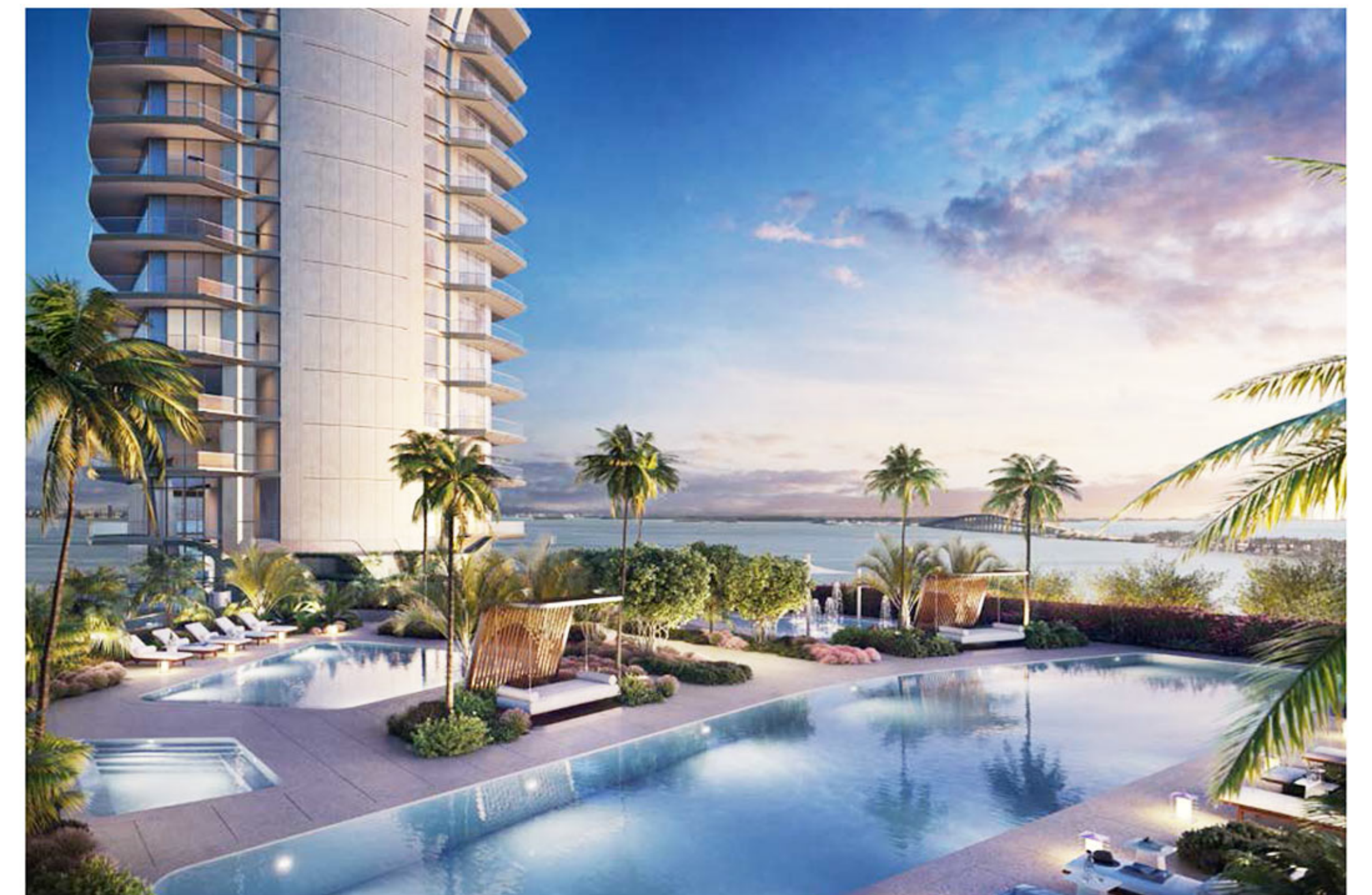
A unique oasis, the third-floor pool deck offers a lap pool, family pool and a children's play area, along with cabanas and outdoor bars.