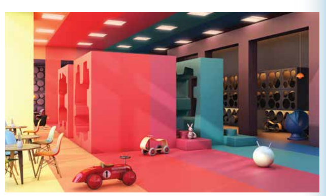
Left: Tea Lounge at Reach Right: Children's playroom

A haven for the culturally curious, the urban adventurers, and the fashion faithful, Brickell City Centre boasts 500,000 square feet of retail and restaurant space right on your doorstep. This is an address to be envied, the destination for the discerning buyer.