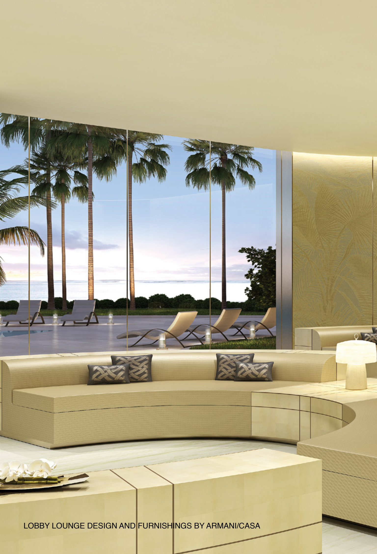
LOBBY LOUNGE DESIGN AND FURNISHINGS BY ARMANI/CASA