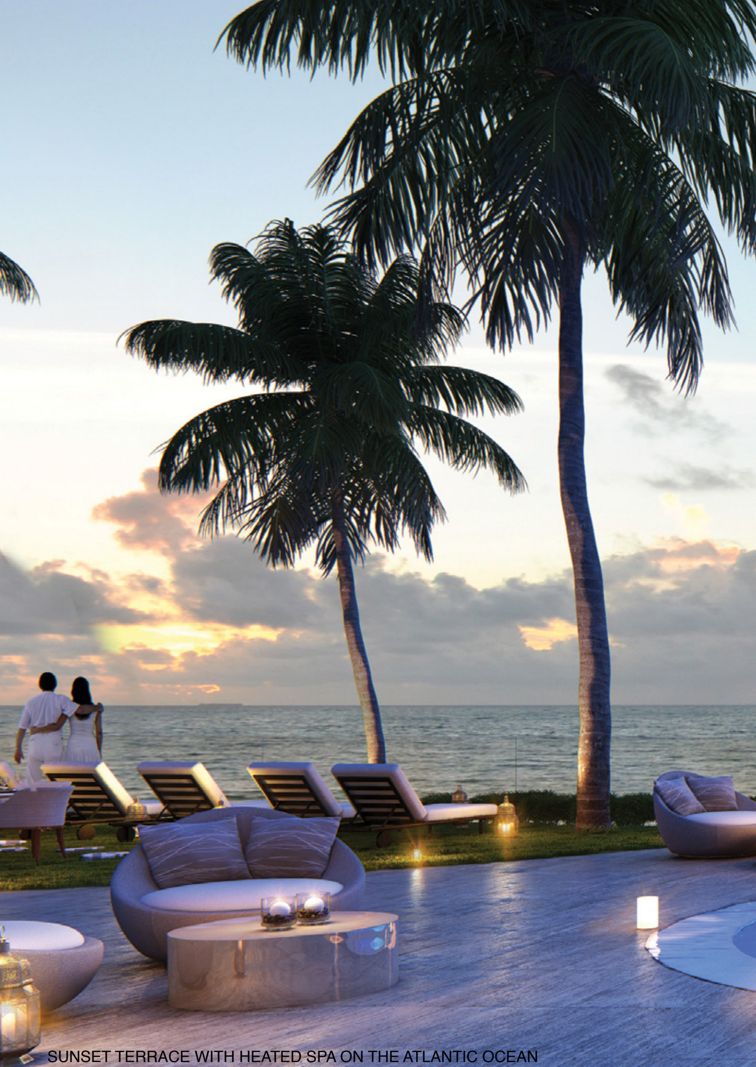
SUNSET TERRACE WITH HEATED SPA ON THE ATLANTIC OCEAN