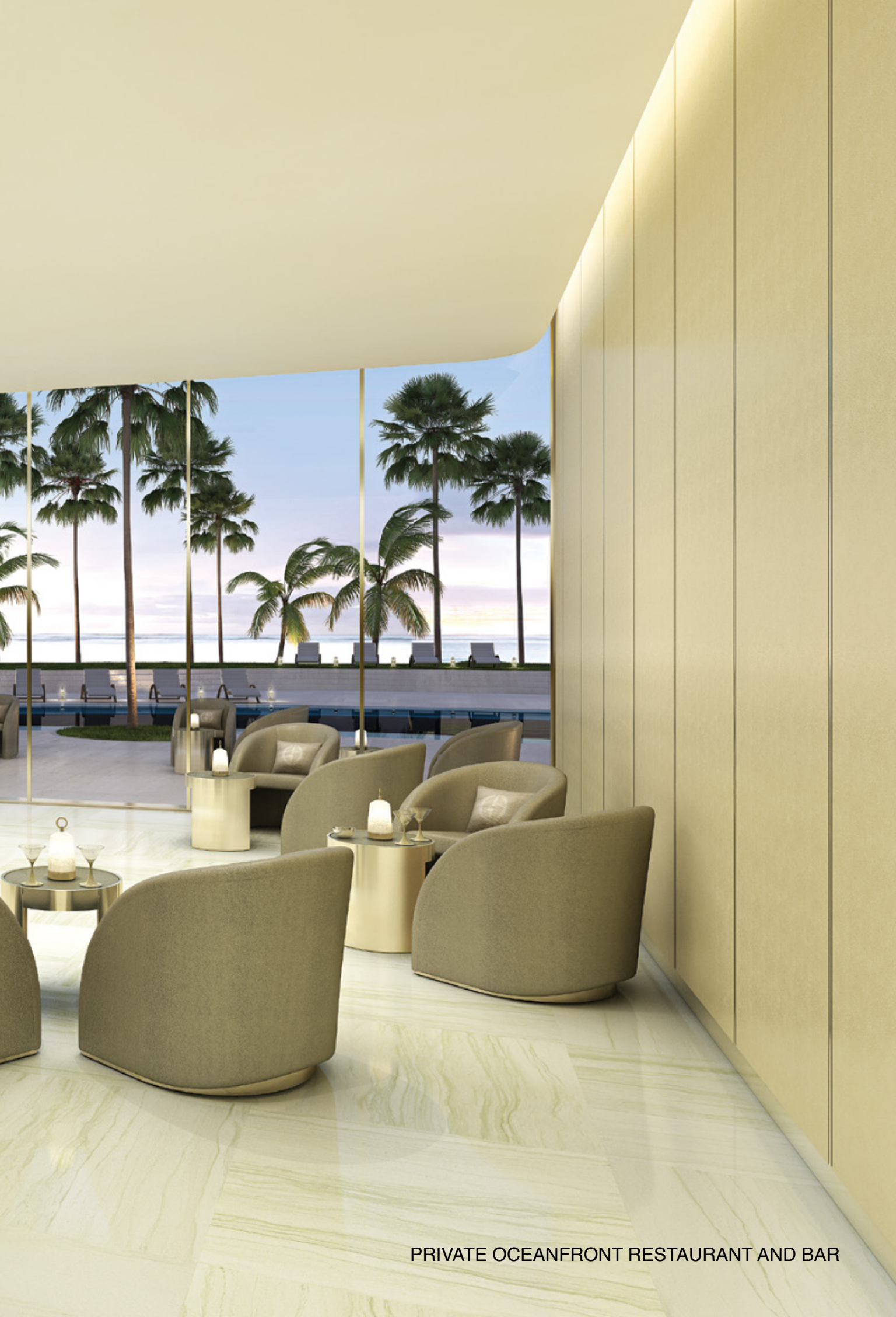
PRIVATE OCEANFRONT RESTAURANT AND BAR