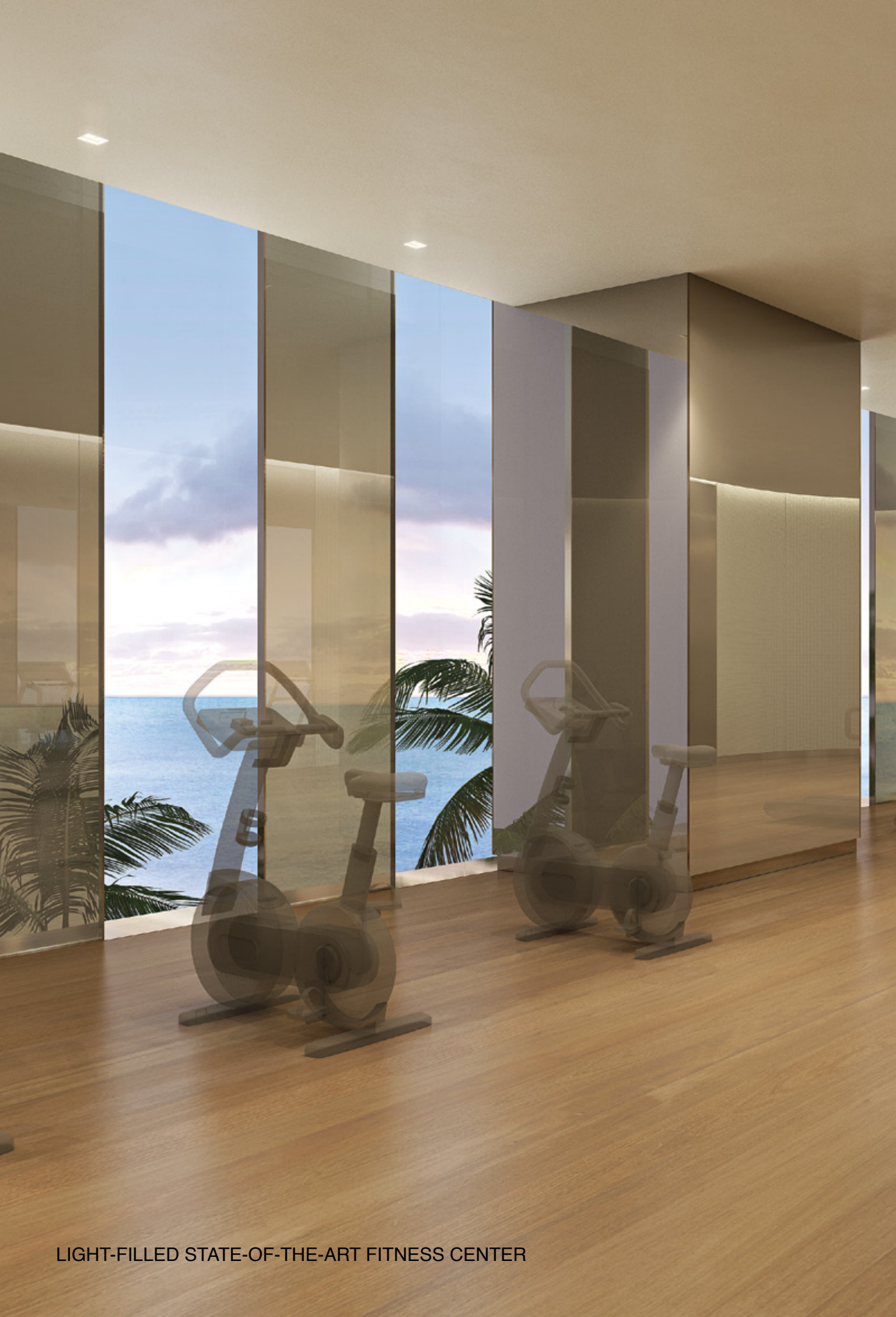
LIGHT-FILLED STATE-OF-THE-ART FITNESS CENTER