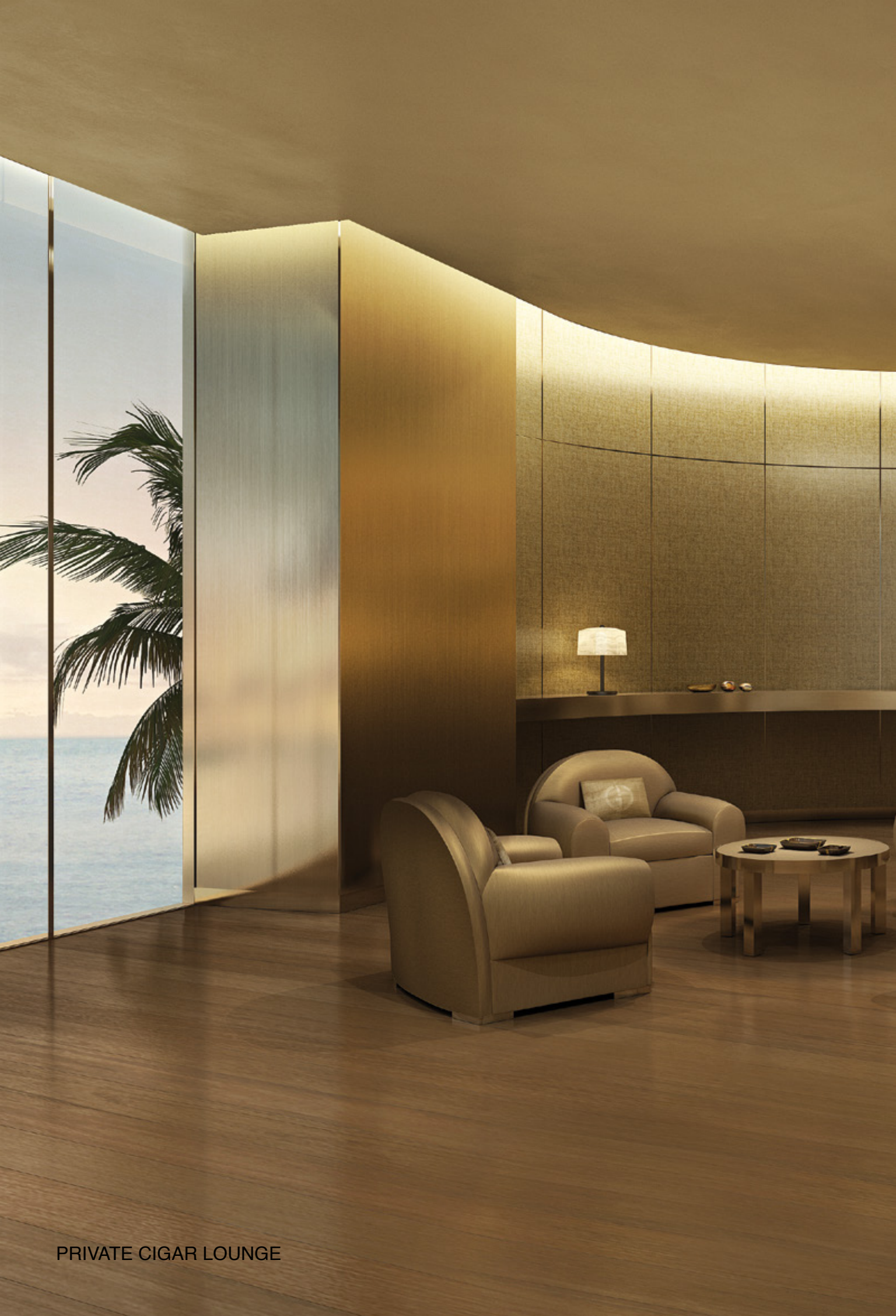
PRIVATE CIGAR LOUNGE