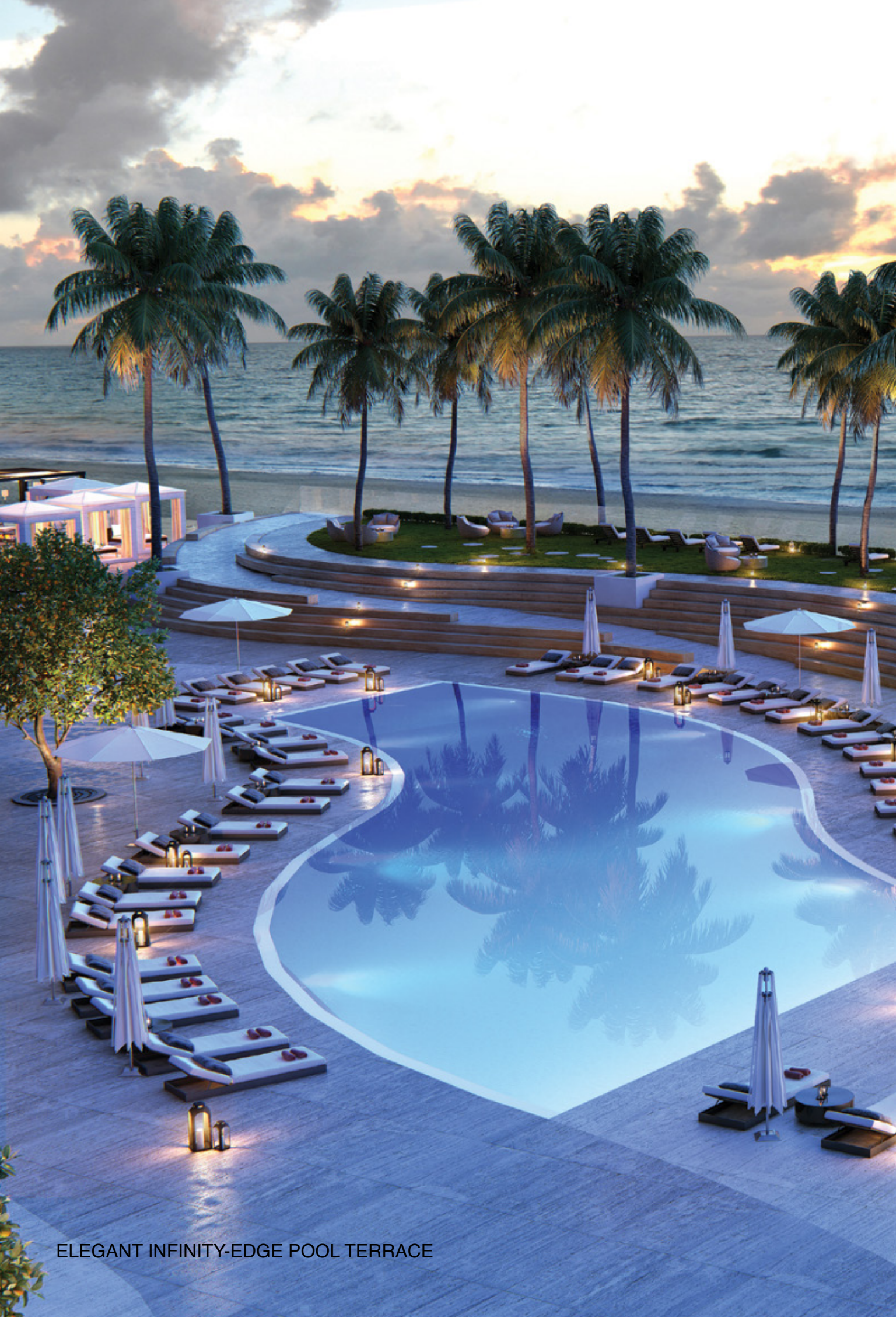
ELEGANT INFINITY-EDGE POOL TERRACE