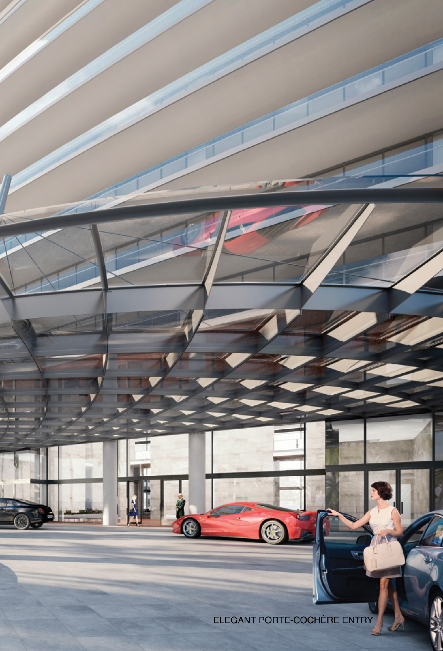
ELEGANT PORTE-COCHÈRE ENTRY