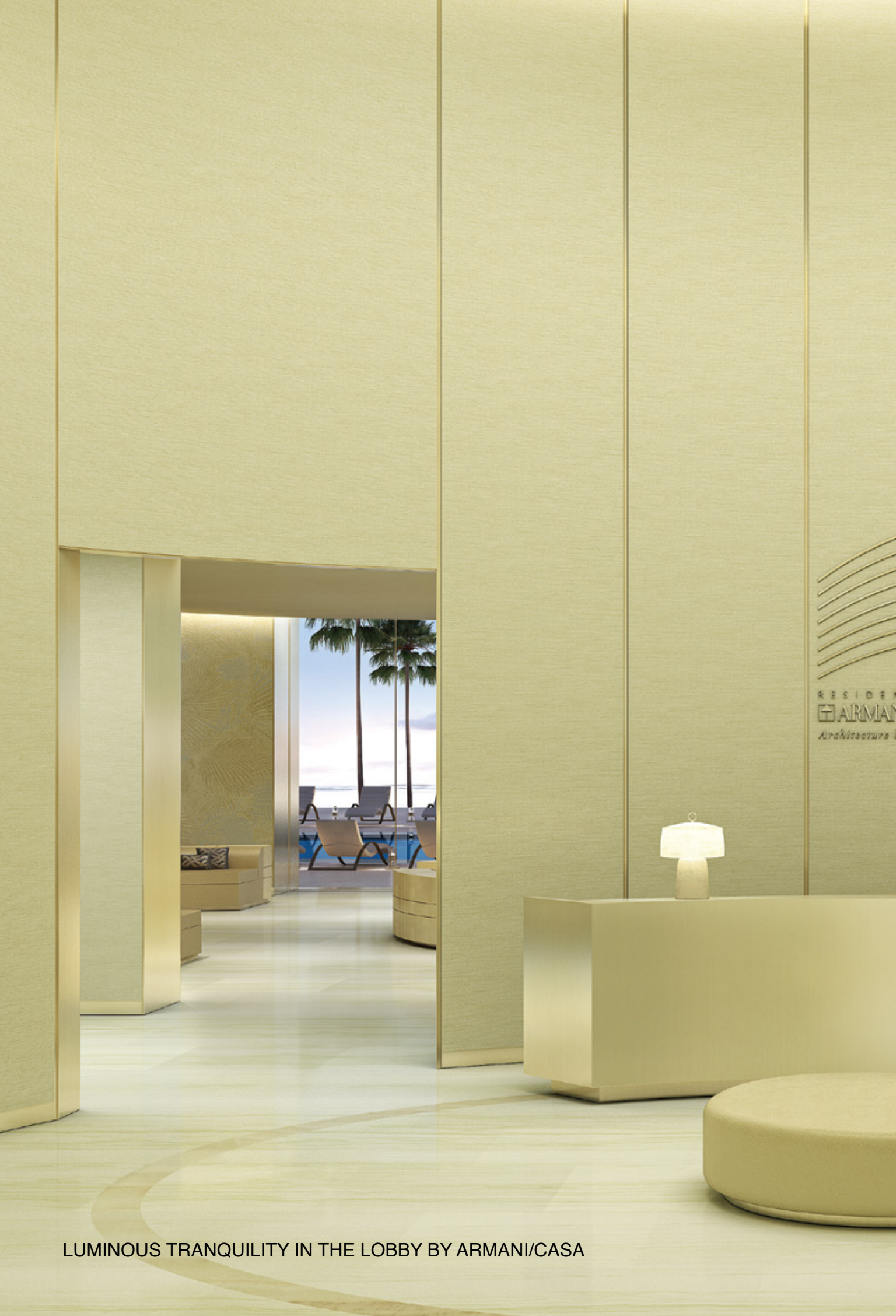
LUMINOUS TRANQUILITY IN THE LOBBY BY ARMANI/CASA